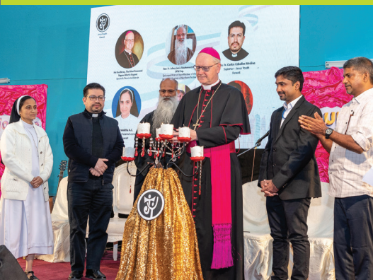
Gaude in Spe, Kuwait