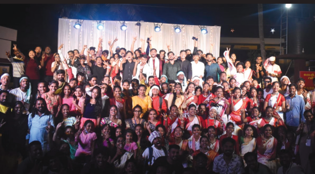
Cultural Exchange Programme, India