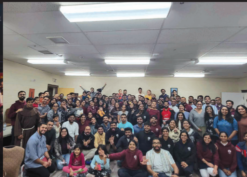
National Leaders' Gathering, Canada