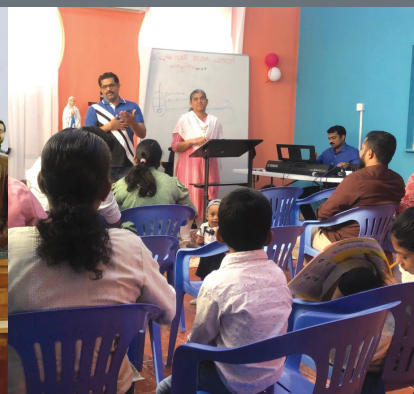
Family Enrichment Program, UAE