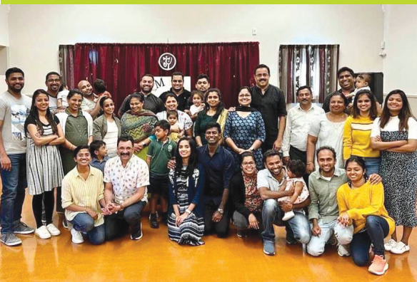
Familia, New Zealand