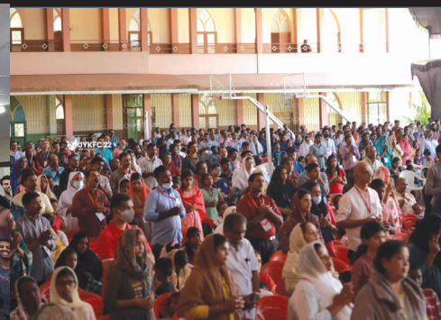
Kerala Family Conference, India