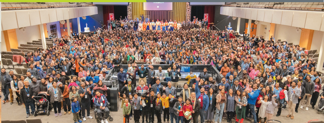
Awaken Conference, USA

conference, 238 families took one month of mission commitment, 195 families committed for accompaniment and all families pledged to be part of a family Small Group. The three-day event was graceful, blissful, and spirit-filled. The ripples of the conference have brought forth a big wave of missionary zeal in the JY families and the movement itself.