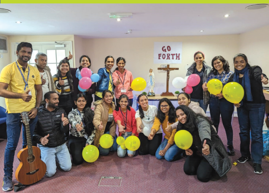
Go Forth, UK