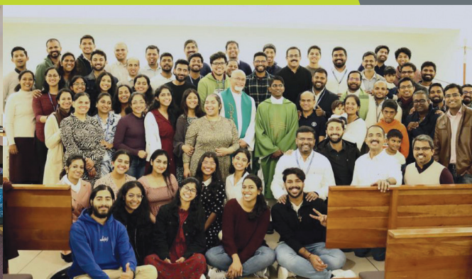
Rise & Go, Europe