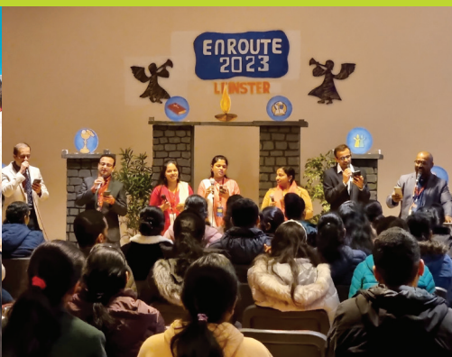
Enroute 2023, Ireland