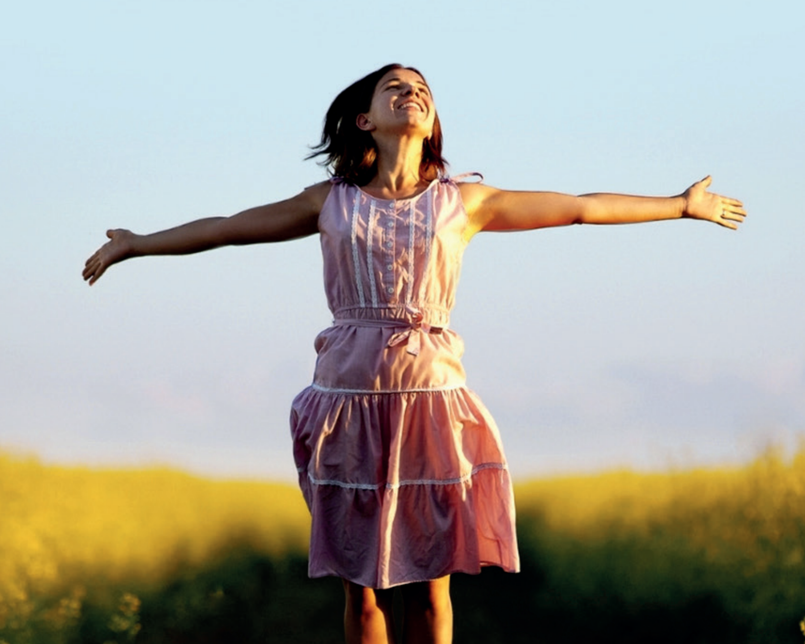
1 THES 4:3